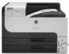
(HP LaserJet Enterprise 700 Printer M712n)