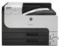
(HP LaserJet Enterprise 700 Printer M712dn)