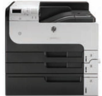
(HP LaserJet Enterprise 700 Printer M712xh)

Mobile printing capability: HP ePrint, Apple AirPrint™